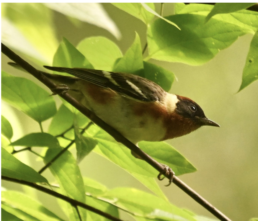
Bay-breasted Warbler

Bay-breasted Warblers are listed as low concern for conservation, but because they are uncommon and nest in largely remote areas, their population is difficult to track. They also specialize in eating spruce budworms, so their population rises and falls with the abundance of their favorite summer food. However, like many birds they are still considered to be in decline overall, with habitat loss and pesticide use being factors. Best of luck as you look for warblers to finish out the month!